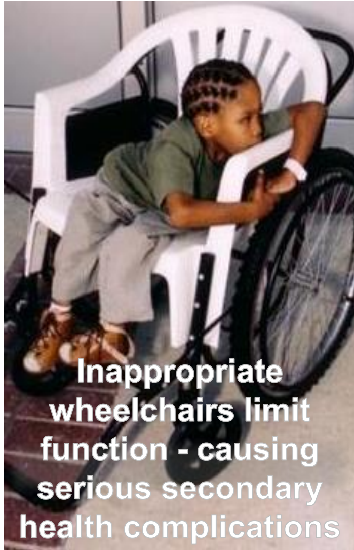
Inappropriate wheelchairs limit function - causing serious secondary health complications