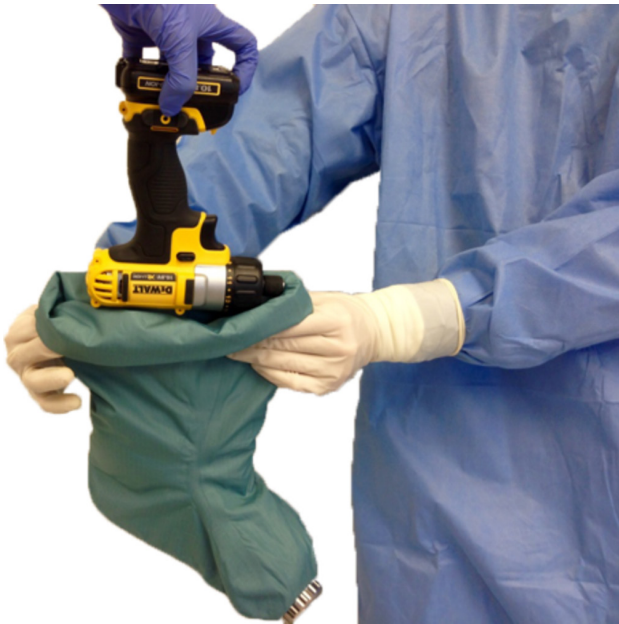
Figure 3 Drill Cover System being assembled.

textile which attaches to a drill's mechanics via a waterproof chuck adapter interface (figures 1–6). This creates a completely sealed barrier between the non-sterile drill on the inside and the sterile surgical field outside. The chuck has a lifetime of at least 600 use cycles when reprocessed appropriately. It can be autoclaved up to 75 times and will be sterile after 30 min exposure of steam autoclave at 121°C, or after 15 min at 131°C, either by using gravity displacement or prevacuum autoclaves. 10