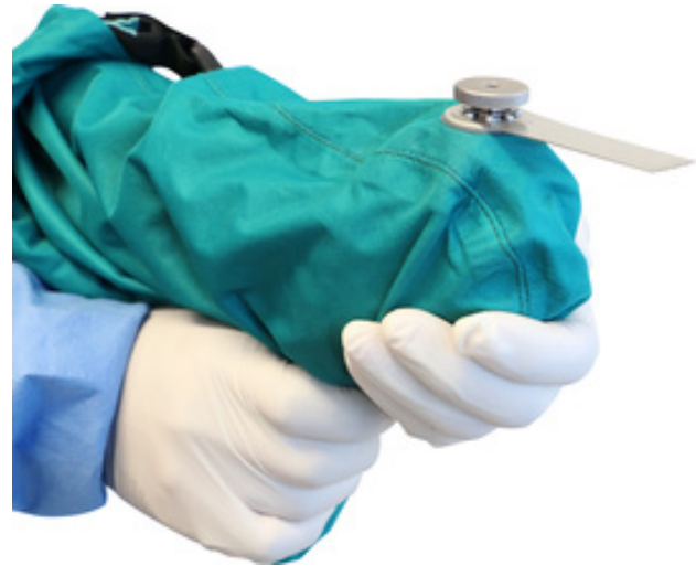
Figure 5 Oscillating saw launching towards the end of 2017. Product will feature a quick-change cam mechanism for easily switching blades (not shown here).

and manufacturing techniques follow an AAMI/ANSI PB70 standard for Level 4 medical barriers. The Drill Cover is CE marked as a Class I medical device, registered with the US Food and Drug Administration and approved with Health Canada. Further tests are being conducted to reclassify the whole package of cover plus drill as a CE Class IIa device.