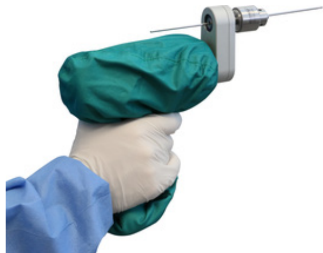
Figure 6 Cannulated drill and reamer launching early 2018. This features a universal quick-change interface for easy exchange of AO, Jacobs, Hudson and K-wire collet during practice.

The Arbutus Drill Cover System is assembled by inserting a non-sterile hardware drill into a sterile cover. The bag edges are rolled down with fingers tucked under during loading, before being rolled back and sealed to encase the hardware drill. (For loading and assembly, please see online supplementary video 2). This is a standard process used in other types of surgery to provide a sterile barrier, most notably